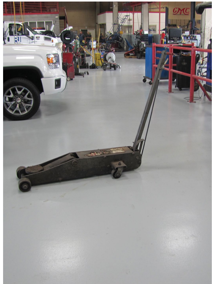
1 Base Coat